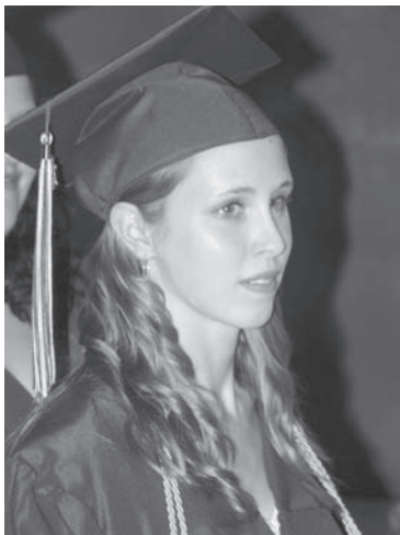
For more examples see the January 2011 newsletter on the district web site.