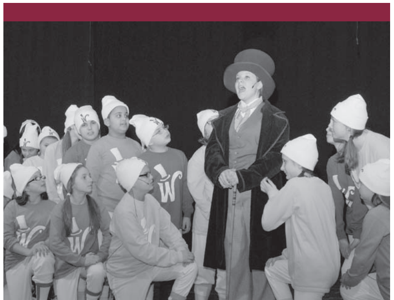
The Sand Creek Middle School Cast & Crew student actors staged Willy Wonka as their spring musical this year.