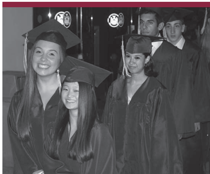
Colonie Central High School held its annual June commencement ceremonies for the Class of 2011 at the Empire State Plaza in Albany. For a photo gallery of this event visit the district website.