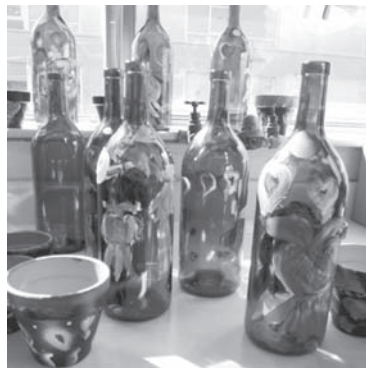
Wine bottles and clay pots painted by S.C. students.