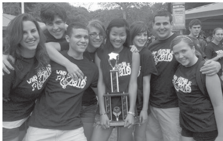
CCHS bands joined the Music in the Parks Festival hosted by Holyoke (MA) High School, with excellent results.