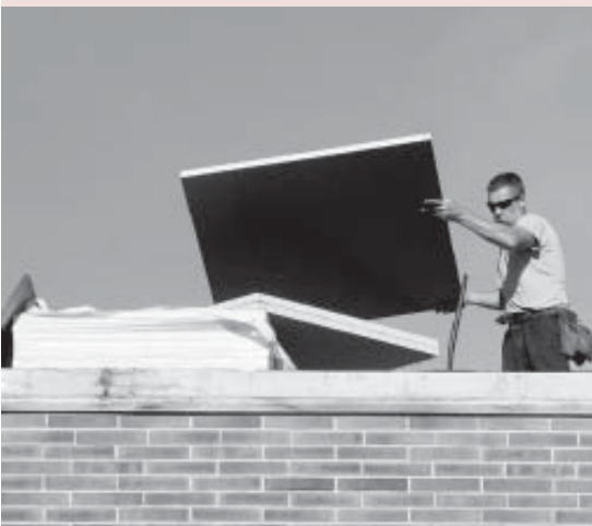
Construction crews replace the roof at Veeder Elementary School.

The entire capital project is scheduled for completion by the 2006-2007 school year. Some repairs like the track resurfacing at the high school and various roof repairs there and at the district bus garage have already been completed.