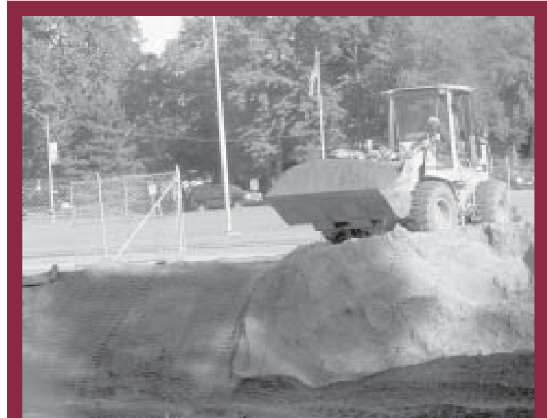
Crews begin the ground work for the construction of a new library addition at Saddlewood Elementary School. Several school projects got underway this summer.

Summer may have been a needed break for South Colonie students and teachers but it has been a busy time for crews working on school renovations and building improvements. The meat of the $22.8 million capital project approved by South Colonie voters in December, 2003, is now underway following approval by the State Education Department and the awarding of contracts. Here's a brief look at the recent construction activity: