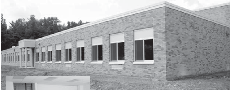
The new three-classroom wing at Veeder Elementary School was completed for fall classes.