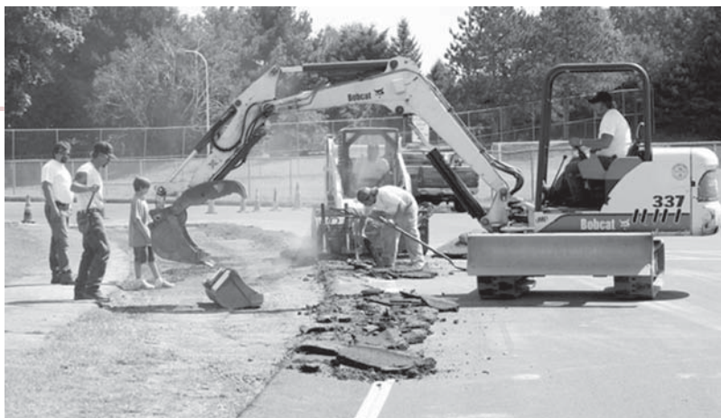
Crews install a new turn lane into the MUG off Raider Boulevard at Colonie Central High School.