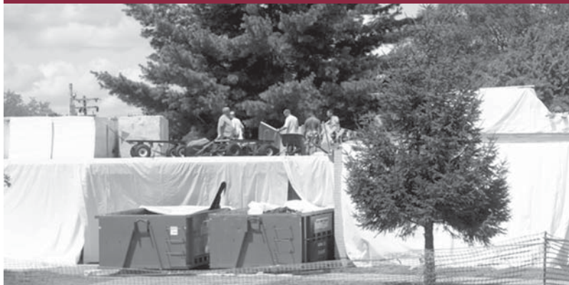
The roofs at Shaker Road (above) and Saddlewood (below) Elementary Schools have been replaced.