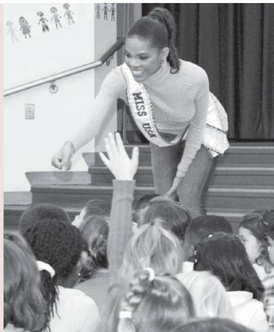
Miss USA greets Roessleville Elementary School students this fall.