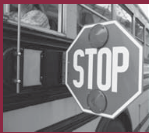
Soaring prices for gasoline and diesel fuel are putting a strain on the South Colonie transportation budget.