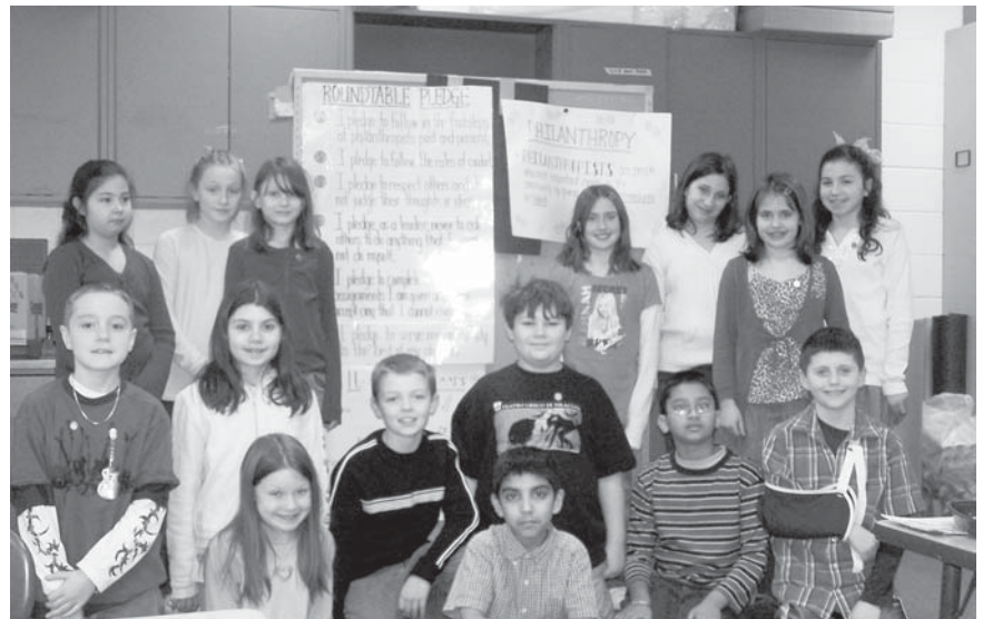
The “Communteers” of Roessleville Elementary School.

The entire school community — students, staff, friends, families and neighbors — took part in harvesting (donating) these pennies during the campaign, which kicked off with a school-wide assembly in October.