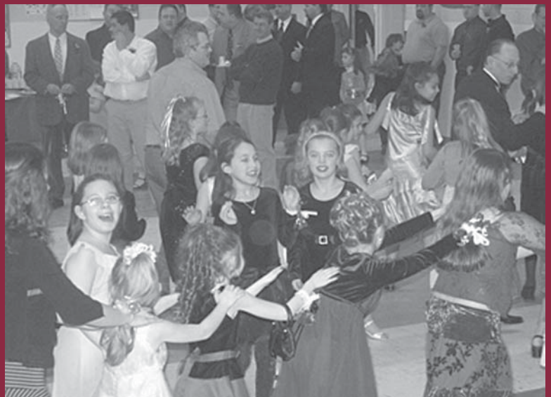
Forest Park Elementary School girls dance the night away in February at the annual Daddy/Daughter Evening sponsored by the school PTA.

Student actors at Sand Creek Middle School will stage the theatrical production of Bye Bye Birdie on April 6-8. All performances are at 7 p.m.