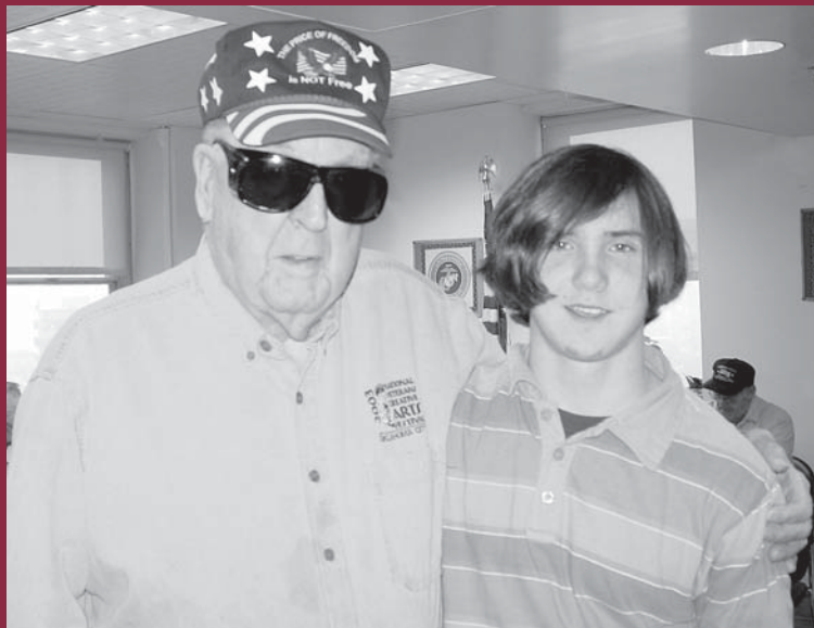
Lisha Kill Middle School students and staff visited with veterans at the Stratton VA Medical Center in Albany. Students delivered wish boxes and hero letters to the patients as part of a community service project.