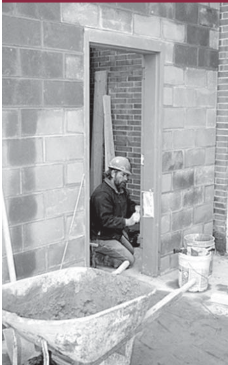
Crews work on concrete walls at Veeder Elementary School's building addition that will house a new cafeteria and gym station.