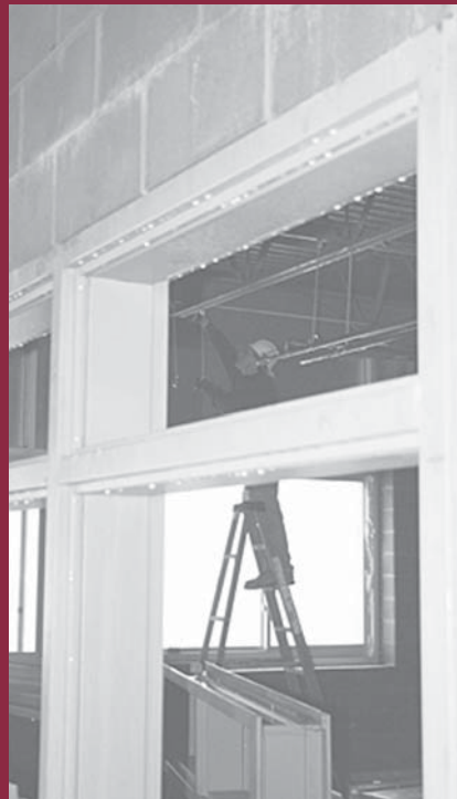
Heating and ventilation systems are installed in the new classroom wing at Lisha Kill Middle School.