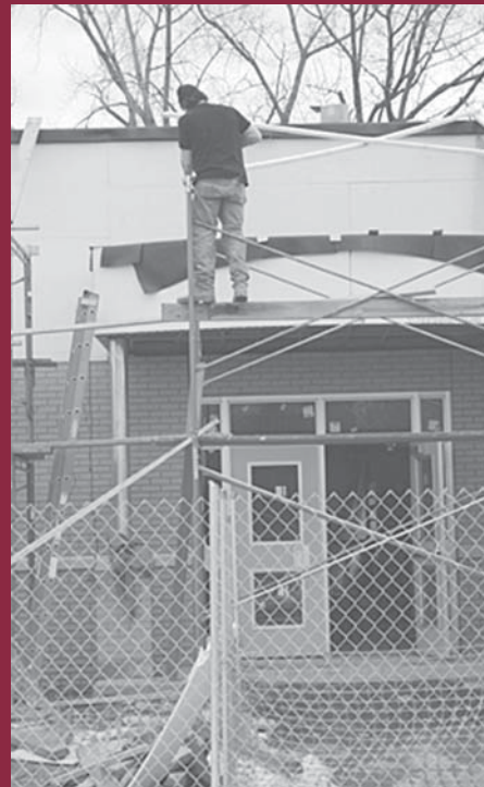
The new library addition being constructed at Saddlewood Elementary School gets some work on its exterior walls.

For more capital project construction photos visit the district's web site at www.southcolonieschools.org