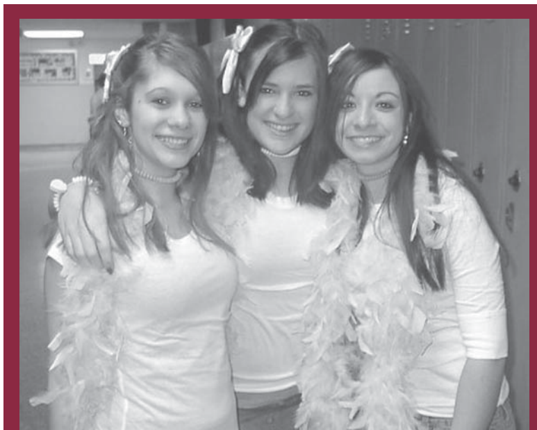
Sand Creek Middle School was seeing double (and sometimes triple) recently as it hosted its annual twin dress alike day to promote creativity and school spirit.