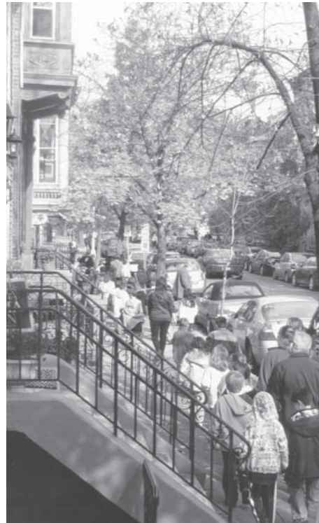
Saddlewood Elementary School students tour the streets of Troy, looking over the unique brownstone buildings as part of their Comparing Communities unit on urban lifestyles.