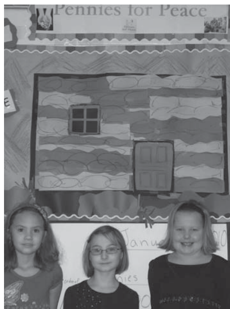
Saddlewood Elementary students collected more than $1,000 for Pennies for Peace in three weeks.

"The students really were 'into' the program and definitely learned how powerful they and their pennies were," explained Anne MackNair, coordinator of the Saddlewood drive. "At our first morning program after the kickoff, we were stunned that students had donated $406! We were all extremely proud. Our subsequent two weeks revealed amounts of $342 and $286.11. We were all overwhelmed by the cumulative total of $1,034.11. Students were cheering! How totally awesome!"