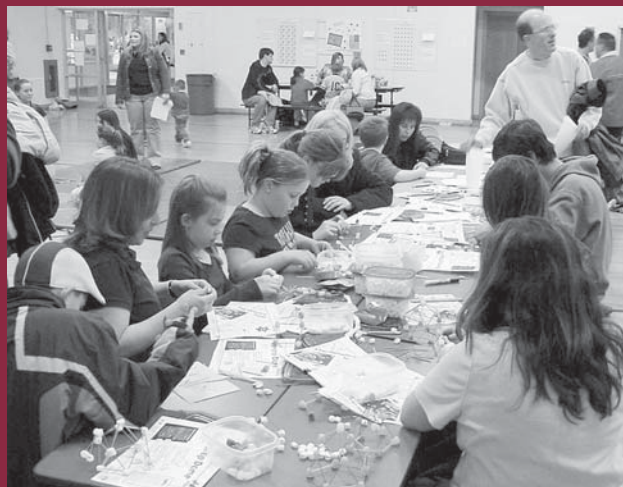
Shaker Road Elementary School held a Family Math Night this spring to help students and parents realize that math doesn't have to be intimidating, it can be fun too! The event included a steak dinner, activities galore and a Girl Scout bake sale.